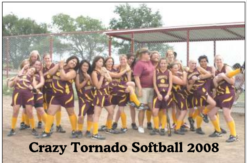
Crazy Tornado Softball 2008