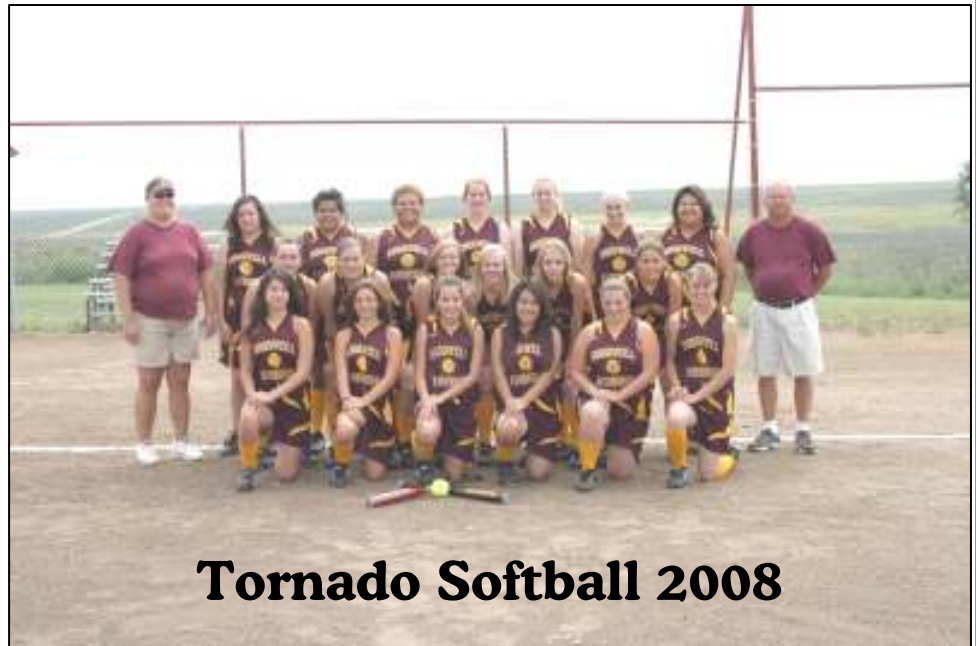
Tornado Softball 2008